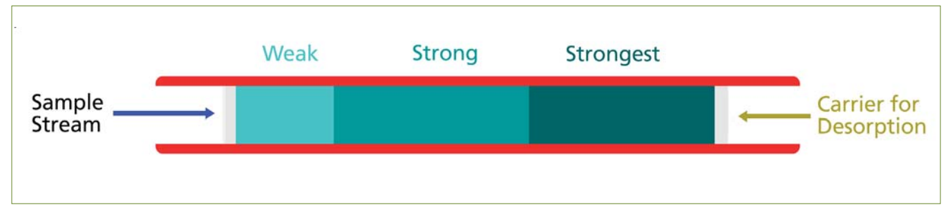
Figure 1. The new PerkinElmer Soil Vapor Extraction desorption tube using multiple adsorbents to accommodate VOCs with a wide boiling point range

The breakthrough volume is a critical factor in the performance of an adsorbent. It is defined according to EPA TO-17 as the volume sampled when the amount of analyte collected in a backup sorbent tube reaches 5% of the total amount collected by both sorbent tubes. The results from a rigorous, real-world experiment of spiking a sample in triplicate with 0.3 µg of 83 VOC mixture, 0.25 ug of a suite of polynuclear aromatic hydrocarbons (PAHs) and 10 ug of diesel (total of 34.6 µg) using a flow rate of 100 mL/min of humidified nitrogen (85% relative humidity) for 100 minutes, detected only two components that showed a slight breakthrough - dichlorofluoromethane (1%) and choromethane (5.4%). Figure 2 illustrates this experiment in greater detail. In fact none of the other 81 VOCs, including some of the gaseous hydrocarbons, such as vinyl chloride, bromomethane, chloroethane, 1, 3-butadiene or trichlorofluoromethane, were detected on the second "unspiked" tube.