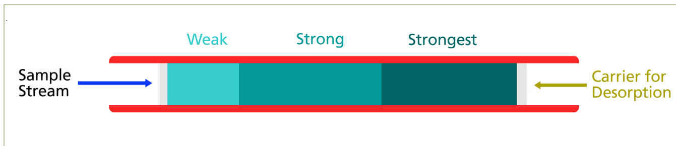
Figure 1. The new PerkinElmer Soil Vapor Extraction desorption tube using multiple adsorbents to accommodate VOCs with a wide boiling point range

The breakthrough volume is a critical factor in the performance of an adsorbent. It is defined according to EPA TO-17 as the volume sampled when the amount of analyte collected in a backup sorbent tube reaches 5% of the total amount collected by both sorbent tubes. The results from a rigorous, real-world experiment of spiking a sample in triplicate with 0.3 µg of 83 VOC mixture, 0.25 µg of a suite of polynuclear aromatic hydrocarbons (PAHs) and 10 µg of diesel (total of 34.6 µg) using a flow rate of 100 mL/min of humidified nitrogen (85% relative humidity) for 100 minutes, detected only two components that showed a slight breakthrough - dichlorofluoromethane (1%) and chloromethane (5.4%). Figure 2 illustrates this experiment in greater detail. In fact none of the other 81 VOCs, including some of the gaseous hydrocarbons, such as vinyl chloride, bromomethane, chloroethane, 1, 3-butadiene or trichlorofluoromethane, were detected on the second "unspiked" tube.