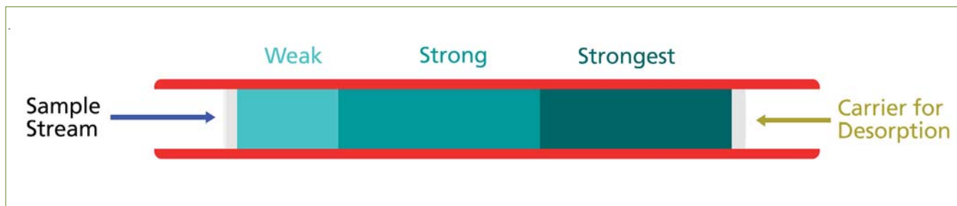
Figure 1. The new PerkinElmer Soil Vapor Extraction desorption tube using multiple adsorbents to accommodate VOCs with a wide boiling point range

The breakthrough volume is a critical factor in the performance of an adsorbent. It is defined according to EPA TO-17 as the volume sampled when the amount of analyte collected in a backup sorbent tube reaches 5% of the total amount collected by both sorbent tubes. The results from a rigorous, real-world experiment of spiking a sample in triplicate with 0.3 µg of 83 VOC mixture, 0.25 µg of a suite of polynuclear aromatic hydrocarbons (PAHs) and 10 µg of diesel (total of 34.6 µg) using a flow rate of 100 mL/min of humidified nitrogen (85% relative humidity) for 100 minutes, detected only two components that showed a slight breakthrough - dichlorofluoromethane (1%) and chloromethane (5.4%). Figure 2 illustrates this experiment in greater detail. In fact none of the other 81 VOCs, including some of the gaseous hydrocarbons, such as vinyl chloride, bromomethane, chloroethane, 1, 3-butadiene or trichlorofluoromethane, were detected on the second “unspiked” tube.